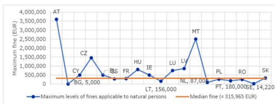
Figure: Maximum levels of criminal fines, applicable to natural persons (EUR) in EU Member States for Article 3(h) offense, and median fine 75

The levels of maximum prison penalties also vary significantly. The graph below illustrates large differences for crimes covered by Article 3(h). A common understanding of what are effective and dissuasive sanction levels has not emerged.